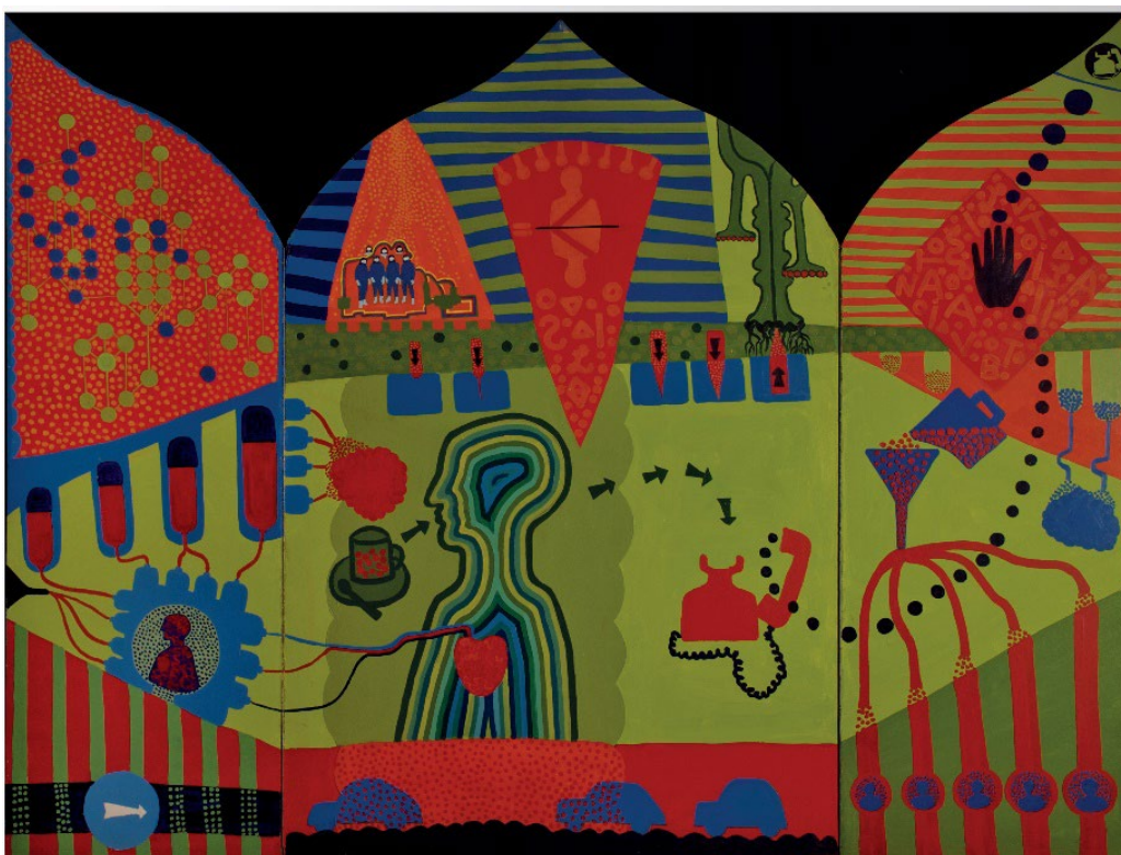
Ulrike Ottinger La vie quotidienne, 1965/66 Triptych, oil on wood © Ulrike Ottinger