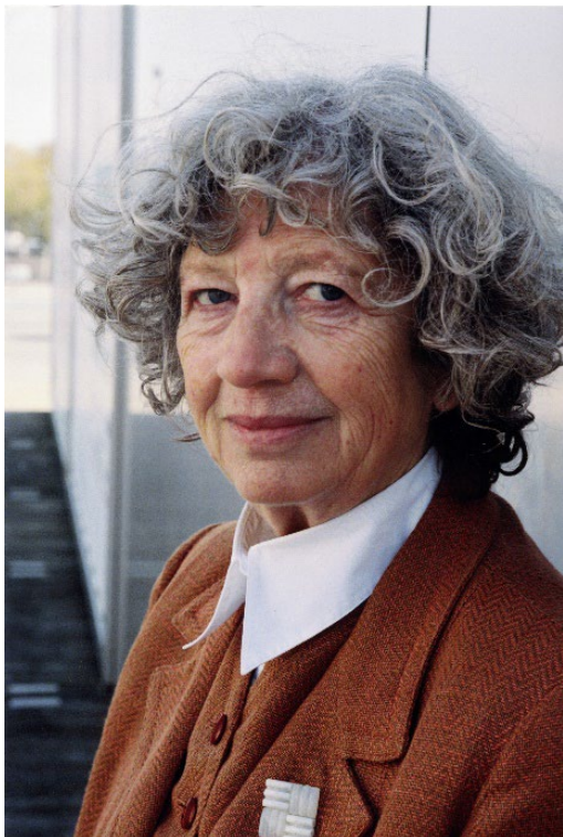
Portrait Ulrike Ottinger

Please note: When used, the images should not be cropped and must not be overwritten with text. The respective captions are mandatory. Please note in any case the © of the images.