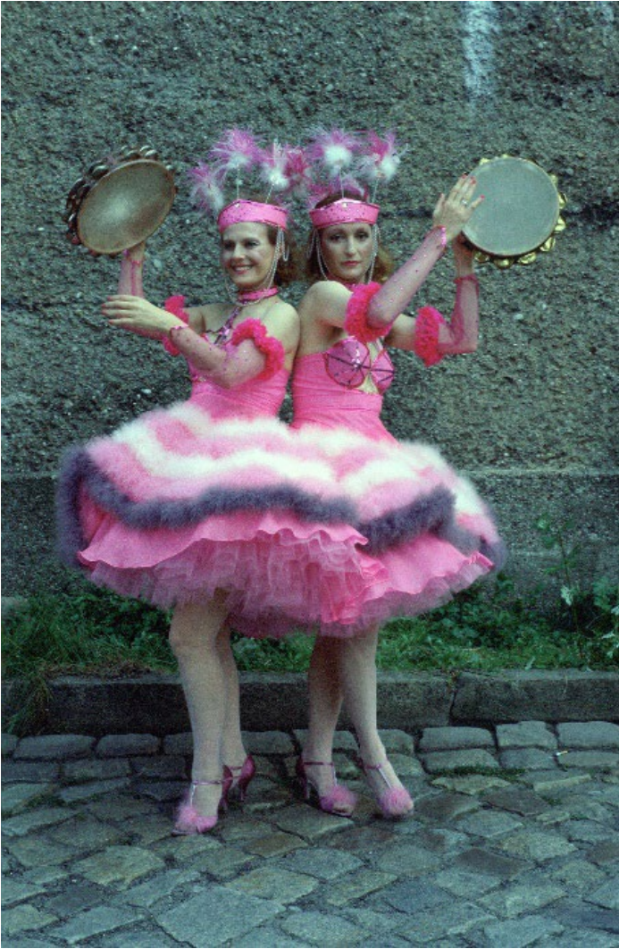
Ulrike Ottinger Die Siamesischen Zwillinge Lena-Leni, 1981