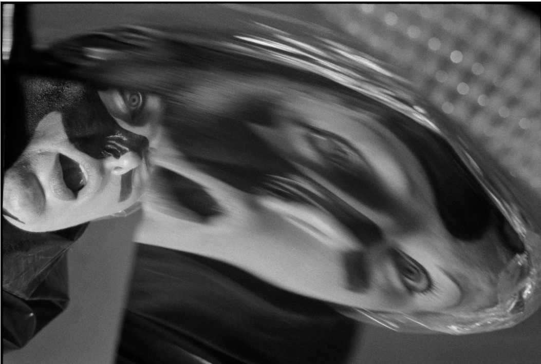
Ulrike Ottinger Verzerrungsstudie, 1980 Photography © Ulrike Ottinger