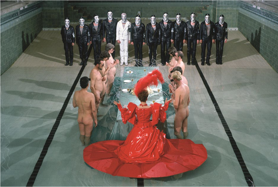
Ulrike Ottinger Das Gastmahl der verfolgten Wissenschaftler und Künstler, 1981